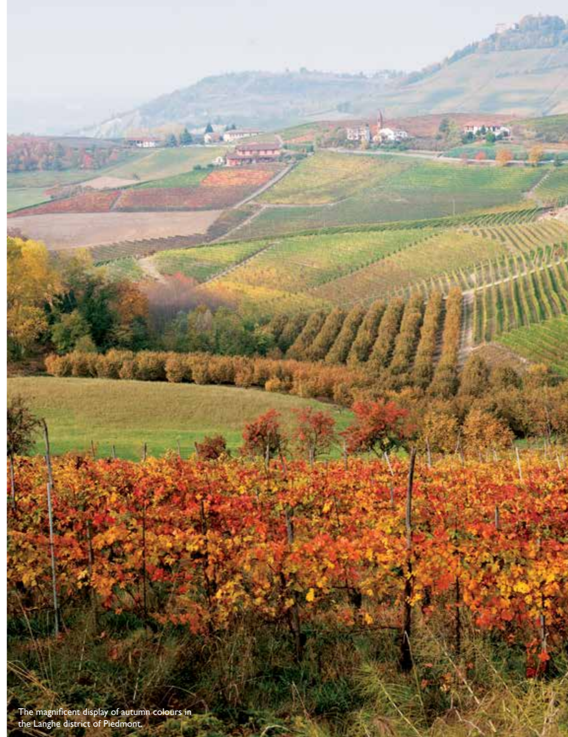
The magnificent display of autumn colours in the Langhe district of Piedmont.