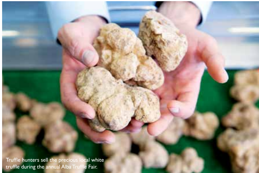
Truffle hunters sell the precious local white truffle during the annual Alba Truffle Fair.